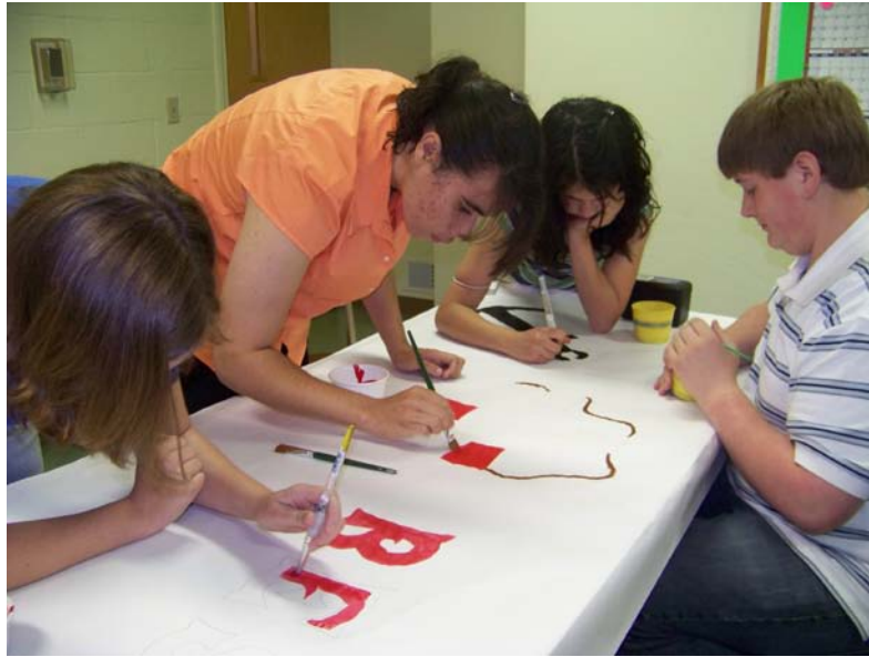
The teens working on making the missions conference theme banner.